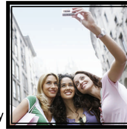
Photo and Video Sharing websites have become a popular form of showcasing the fun events going on in families and among friends. All sites require a registration process, some offer free (limited) storage of photos, while others charge a yearly fee to host your images.